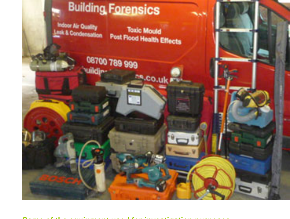
Some of the equipment used for investigation purposes